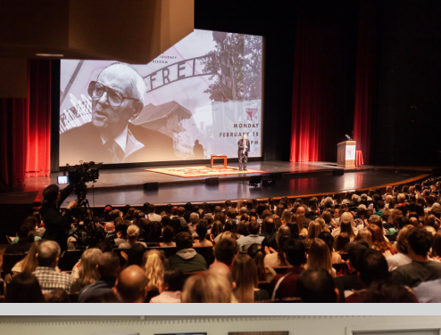
"I want to have a Jewish family. I want to be part of and continue the Jewish legacy."

THANK YOU! The next generation is empowered because of YOU! Thank you for giving me this incredible opportunity.