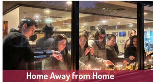
Home Away from Home