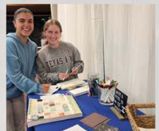
IDF Support Letters