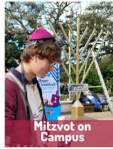
Mitzvot on Campus

The rise of antisemitism, finals and Chanukah is a rough combination and YOU gave students a warm, loving, and welcoming embrace.