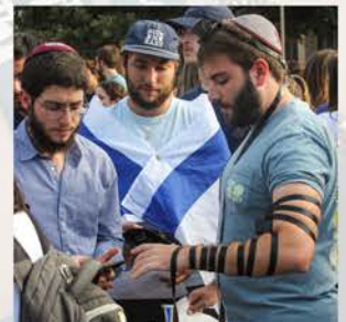
Tefillin for Israel