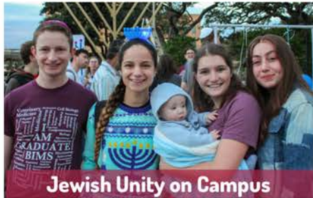
Jewish Unity on Campus