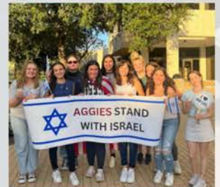
Support Israel March