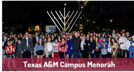
Texas A&M Campus Menorah